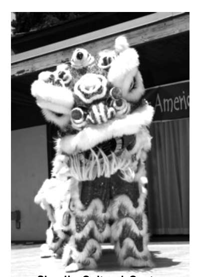
Shaolin Cultural Center performs a Chinese Lion Dance

The Asian Pacific American Heritage Celebration involved the OCA San Mateo Chapter, the Asian American Curriculum Project, Japanese American Citizens League, and the Downtown San Mateo Association (DSMA). It was a fun